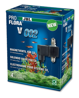
JBL PROFLORA v002 Noiseless solenoid valve