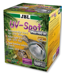
JBL UV-Spot plus UV spotlight with daylight spectrum for terrariums