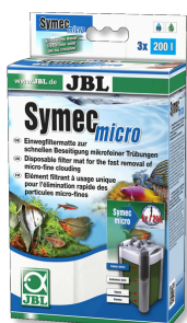
JBL Symec micro Microfibre fleece against water cloudiness