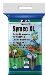
JBL Symec XL Coarse filter wool to remove all types of water cloudiness