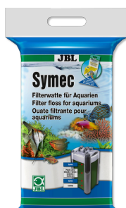
JBL Symec Filter floss Filter wool to remove all types of cloudiness