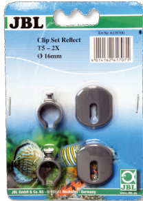
JBL SOLAR REFLECT Clip Set Holder for fluorescent tubes