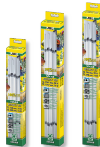
JBL SOLAR Reflect T5/ T8 - 895-1500 mm Reflector panel for fluorescent tube