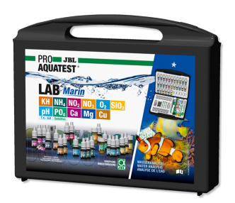
JBL PROAQUATEST LAB Marin Professional test case for

Professional test case for marine water analysis