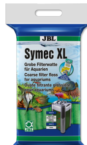
JBL Symec XL Coarse filter wool to remove all types of water cloudiness