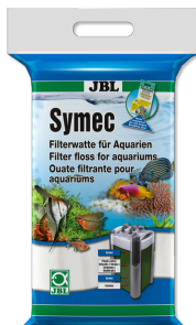
JBL Symec Filter floss Filter wool to remove all types of cloudiness