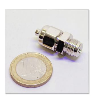
JBL tube screw connection 4/6 pressure reducer