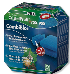
JBL CombiBloc CristalProfi e Pre-filter pads and filter foam for CristalProfi e