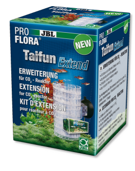
JBL PROFLORA Taifun Extend Extension for CO2 highperformance diffuser