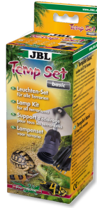
JBL TempSet basic Installation kit for lamps in terrariums