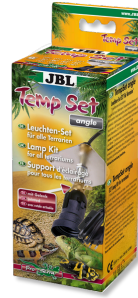
JBL TempSet angle Installation kit for lamps in terrariums