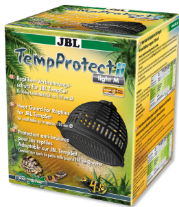
JBL TempProtect II light Reptile thermal burn protection for JBL TempSet items