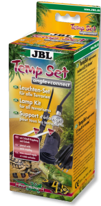
JBL TempSet angle+ connect Installation kit for lamps in terrariums