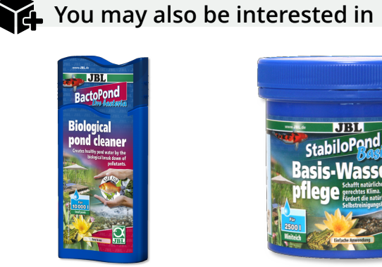
JBL BactoPond Bacteria for biological purification of the pond