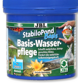
JBL StabiloPond Basis Basic care product for all garden ponds