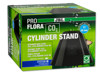
JBL PROFLORA CO2 CYLINDER STAND

Wall mount for CO2 cylinders with safety bracket