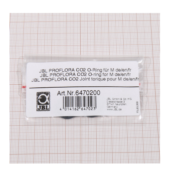
JBL PROFLORA CO2 Oring for m