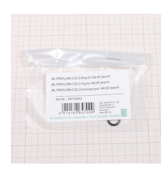
JBL PF CO2 O-ring for VALVE