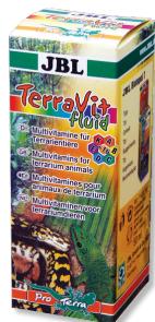
JBL TerraVit fluid Vitamins and trace elements for terrarium animals