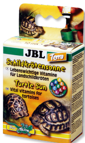
JBL Tortoise Sun Terra Vitamins for tortoises