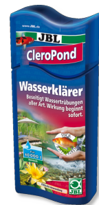
JBL CleroPond Water clarifier for the elimination of water cloudiness