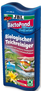
JBL BactoPond Bacteria for biological purification of the pond