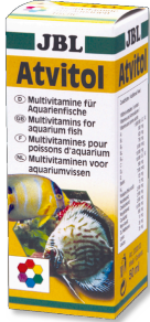
JBL Atvitol Multivitamin drops for aquarium fish