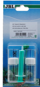
JBL component set for water tests