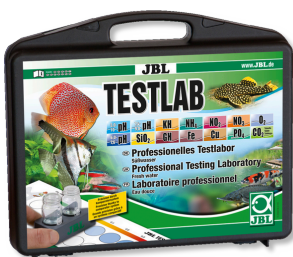
JBL Testlab Test case with 13 tests f. freshwater analysis Testlab