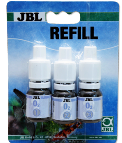
JBL Oxygen Test O2 - New Formula Quick test for the determination of the oxygen content