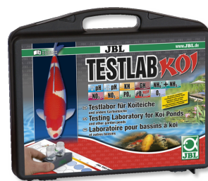
JBL Testlab Koi Professional test case for koi and garden ponds