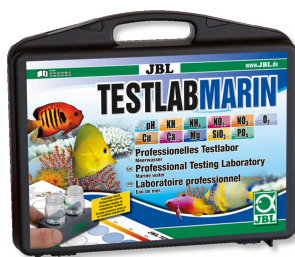
JBL Testlab Marin Professional test case for the analysis of saltwater