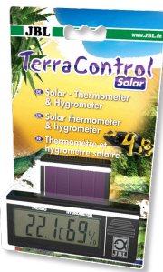
JBL TerraControl Solar Solar-powered thermometer + hygrometer for terrariums