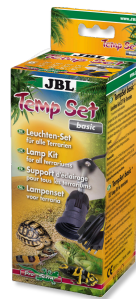
JBL TempSet basic Installation kit for lamps in terrariums