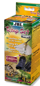
JBL TempSet angle Installation kit for lamps in terrariums