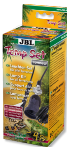
JBL TempSet connect Installation kit with connector