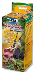
JBL TempSet angle+ connect Installation kit for lamps in terrariums