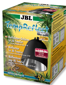
JBL TempReflect light Reflector screen for energy- saving lamps