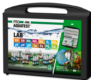
JBL PROAQUATEST LAB Test case with 13 water tests for freshwater analysis