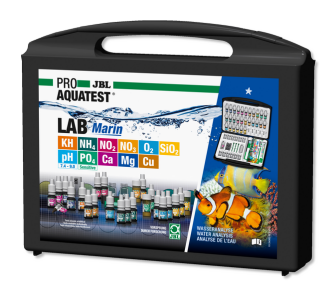
JBL PROAQUATEST LAB Marin

Professional test case for marine water analysis