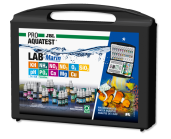
JBL PROAQUATEST LAB Marin

Professional test case for marine water analysis