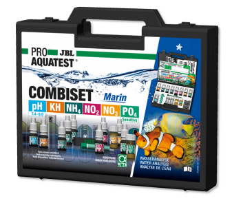
JBL PROAQUATEST COMBISET Marin

Professional test case for marine water analysis