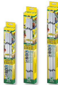
JBL SOLAR Reflect T5/ T8 - 895-1500 mm Reflector panel for fluorescent tube