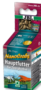
JBL NanoCrabs Main food for dwarf crayfish