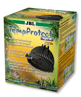
JBL TempProtect light Reptile thermal burn protection for JBL TempSets