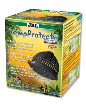
JBL TempProtect II light Reptile thermal burn protection for JBL TempSet items