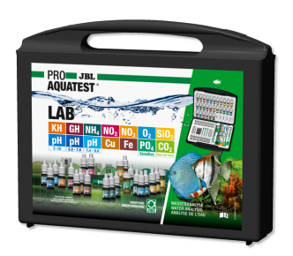
JBL PROAQUATEST LAB Test case with 13 water tests for freshwater analysis