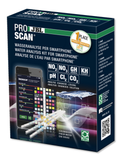
JBL PROSCAN Water test with analysis via smartphone