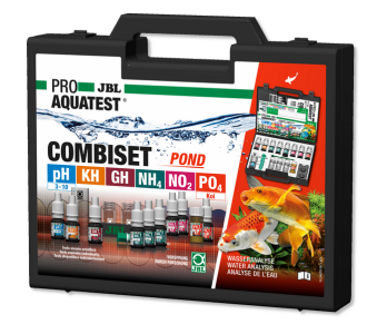
JBL PROAQUATEST COMBISET POND

Test case for water analyses in koi and garden ponds