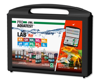
JBL PROAQUATEST LAB Κ̀οί

Test case for water analyses in koi and garden ponds