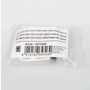
JBL PF CO2 COUNT SAFE holder set