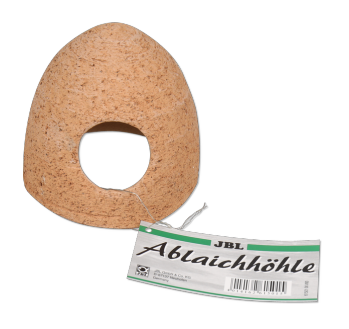
JBL Ceramic spawning cave Ceramic cave for freshwater aquariums