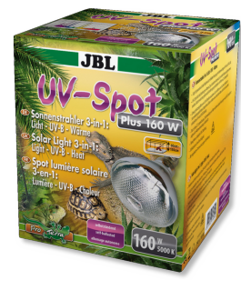
JBL UV-Spot plus UV spotlight with daylight spectrum for terrariums