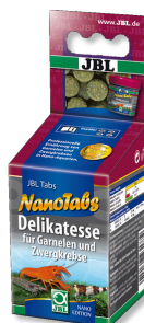
JBL NanoTabs Main food for shrimp and dwarf crayfish