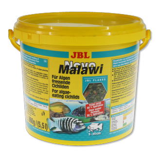
JBL NovoMalawi Main food flakes for algaeeating cichlids