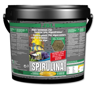
JBL Spirulina Premium main food for algaeeating aquarium fish