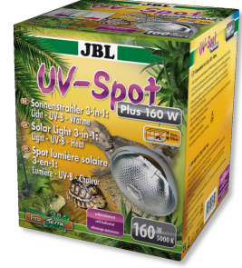
JBL UV-Spot plus UV spotlight with daylight spectrum for terrariums