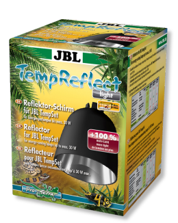
JBL TempReflect light Reflector screen for energysaving lamps