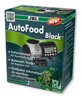
JBL AutoFood BLACK Black automatic feeder for aquarium fish