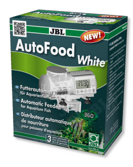
JBL AutoFood WHITE White automatic feeder for aquarium fish