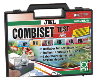
JBL Test Combi Set Pond The most important water tests for garden ponds