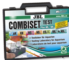
JBL Test Combi Set Plus NH4 Test case with most important water tests + NH4 test