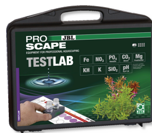
JBL Testlab ProScope Test case for water analysis in plant aquariums