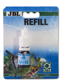
JBL pH Test 3.0-10.0 Quick test to determine the acidity