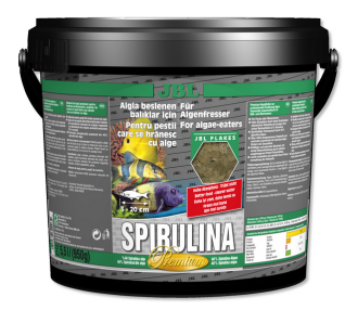
JBL Spirulina Premium main food for algaeeating aquarium fish