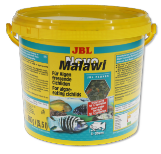
JBL NovoMalawi Main food flakes for algaeeating cichlids