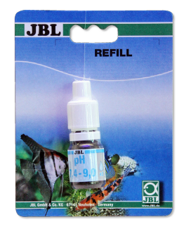
JBL pH Test 7.4-9.0 pH test in aquariums and ponds in the range 7.4-9.0