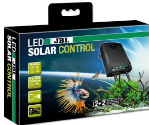
JBL LED SOLAR CONTROL