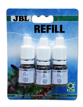
JBL Oxygen Test O2 -New Formula Quick test for the determination of the oxygen content