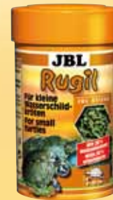
JBL Rugil Food sticks for small turtles