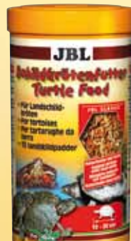
JBL Turtle Food Staple food for all turtles