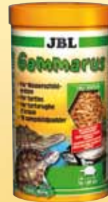
Washed water fleas, staple food for turtles