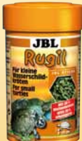
JBL Rugil Food sticks for small turtles