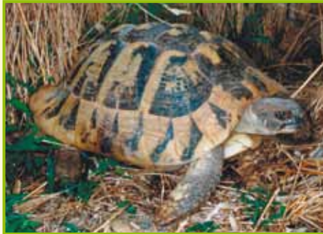
Testudo hermanni boettgeri