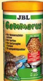
JBL Gammarus Washed water fleas, staple food for all turtles