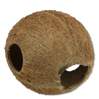
JBL Cocos Cava Coconut cave for aquariums and terrariums