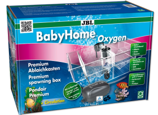
JBL BabyHome Oxygen Premium spawning box complete kit with air pump