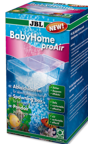
JBL BabyHome pro Air Spawning box for air stone installation