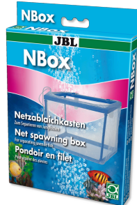
JBL NBox Net Spawning Box