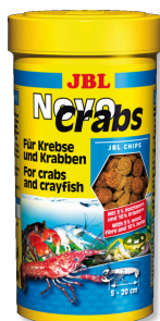
JBL NovoCrabs Main food wafers for crabs