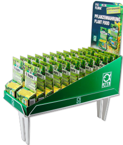
JBL tray 381 x 186 x 30mm