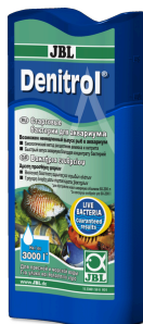
JBL Denitrol Bacteria starter for adding aquarium fish