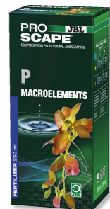
JBL PROSCAPE P MACROELEMENTS Phosphorus plant fertiliser for aquascaping