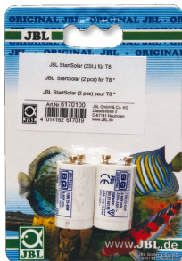
JBL Start Solar Starter for T8 fluorescent tubes