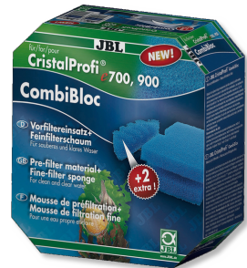
JBL CombiBloc CristalProfi e Pre-filter pads and filter foam for CristalProfi e