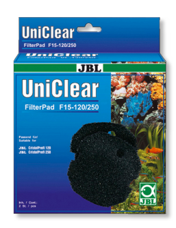
JBL FilterPad F15 Coarse foam pad for aquarium filter CristalProfi