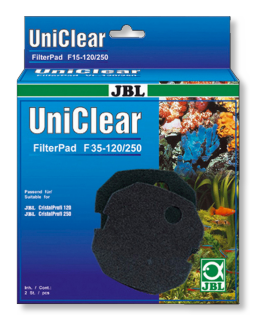
JBL FilterPad F35 Fine foam pad for aquarium filter CristalProfi